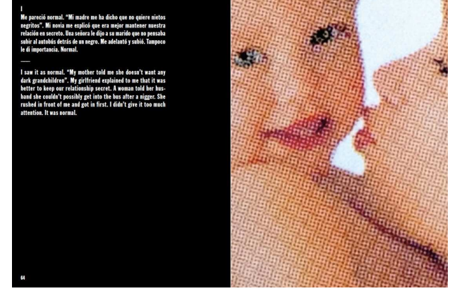
Figure 1 ( YT 192-93)