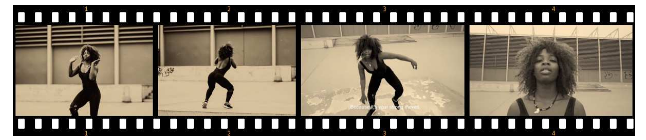
Film Strip 3 ( G ; scene starts at 12:18 min.)

Again, the voice-over emblazes these pictures with a highly poetic text. The text plays with the notions of the term "mother" as one who gives life, cares, and empowers on a literal (the child's mother) and symbolic level (Africa). At the same time, it evokes a matrilineal African genealogy by calling the woman "Mother. Grandmother. Daughter." ( G 14:37 min.) and opens up a historical dimension of African and/or Afrodiasporic experiences that are oppressed and silenced by a historiography written by the winners—that is, according to Aparicio ( The Cultural 44), white heterosexual men—, as the voice-over affirms at the beginning of Chapter Three: "The elephant will always be the evil, if the hunter is the one who tells the story" ( G 23:38 min.). <sup>26</sup> That quote underlines the documentary's goal to embrace a different picture of Africa and what it means to be of African descent. And that picture, according to the artist, denounces the stereotyping of the African continent from a Eurocentric point of view, unveils African/Afrodescendant people's own stories "without filters or intermediaries" ( Ethnicities Magazine n. p.), and aims to "abrir las mentes" [open minds] ( The Cultural 43).