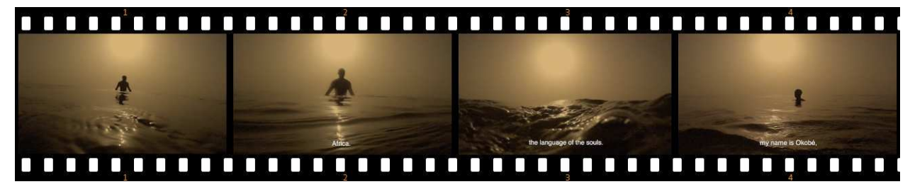
Film Strip 1 ( G ; scene starts at 1:05 min.)

and separates us" (see below). At the same time, there is a conspicuous continuous presence not only of music and dance but also of a subject who, through her/his corporeality, her/his voice and body, embraces her/his African descent and heritage as a symbolic anchor for her/his identificational positionings. Yet, Aparicio keeps mixing diverse cultural references through visual, auditive, and textual elements that entangle his journey with a multitude of different spaces and open up a transcultural map that de-centers the subject's connectedness. Accordingly, the voice-over comments that "[b]orders don't move, people do " ( G 27:48; my emphasis).