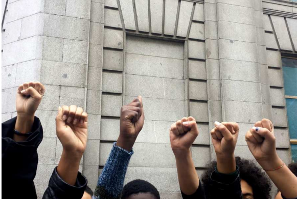
Figure 5 ( YT 56-57)